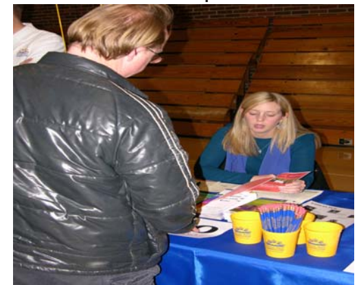
An EOC Education Specialist provides information on completing the financial aid application.