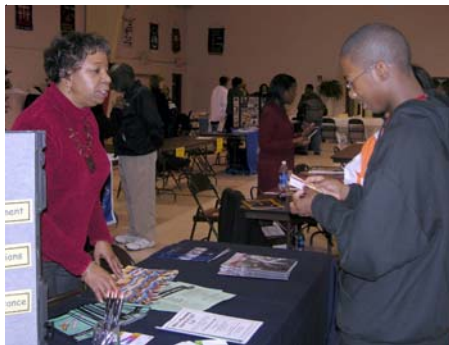
An EOC Education Specialist provides information to potential college students.